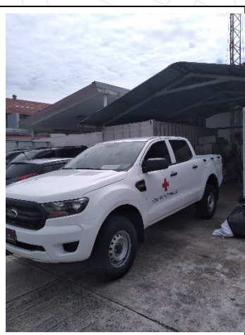
Side stickers with the Donor information