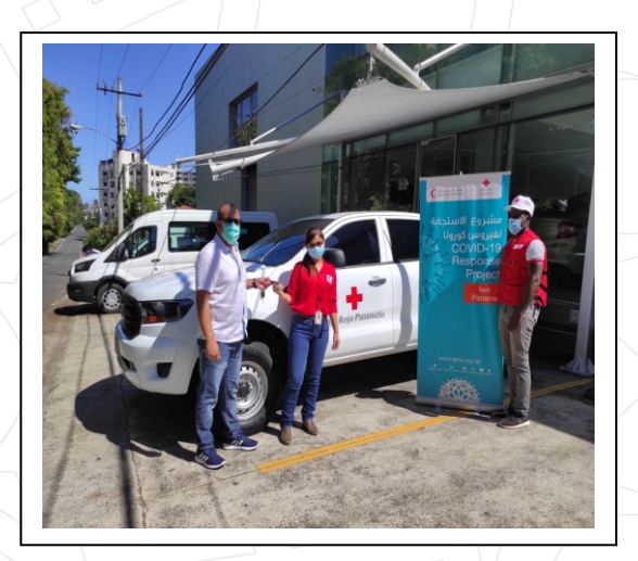
Keys reception by Purchase Chief at the concessionary.